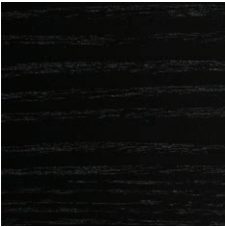
Black Stained Ash