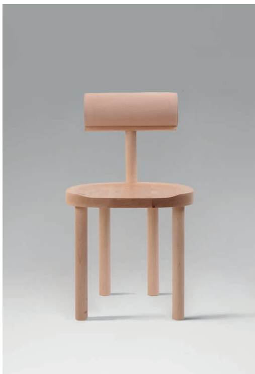
Natural Leather Maple