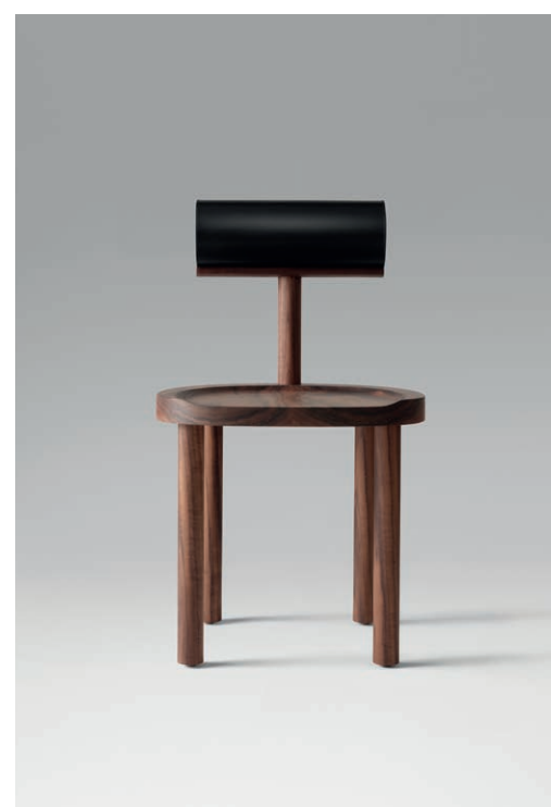
Black Leather Oiled Walnut