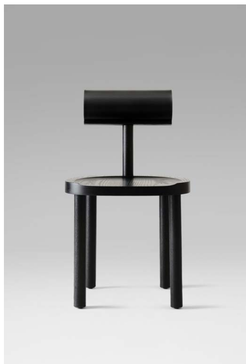
Black Leather Black Stained Ash