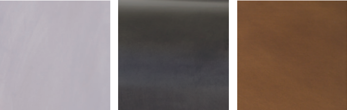
Buffed Aluminum Blackened Steel Burnished Brass

Please note: All of our metal products have a clearcoat for further protection.