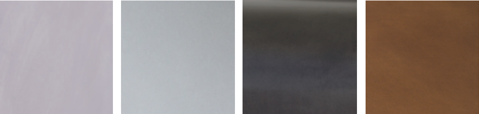
Buffed Aluminum Polished Stainless Steel Blackened Steel Burnished Brass

Please note: All of our metal products have a clearcoat for further protection.