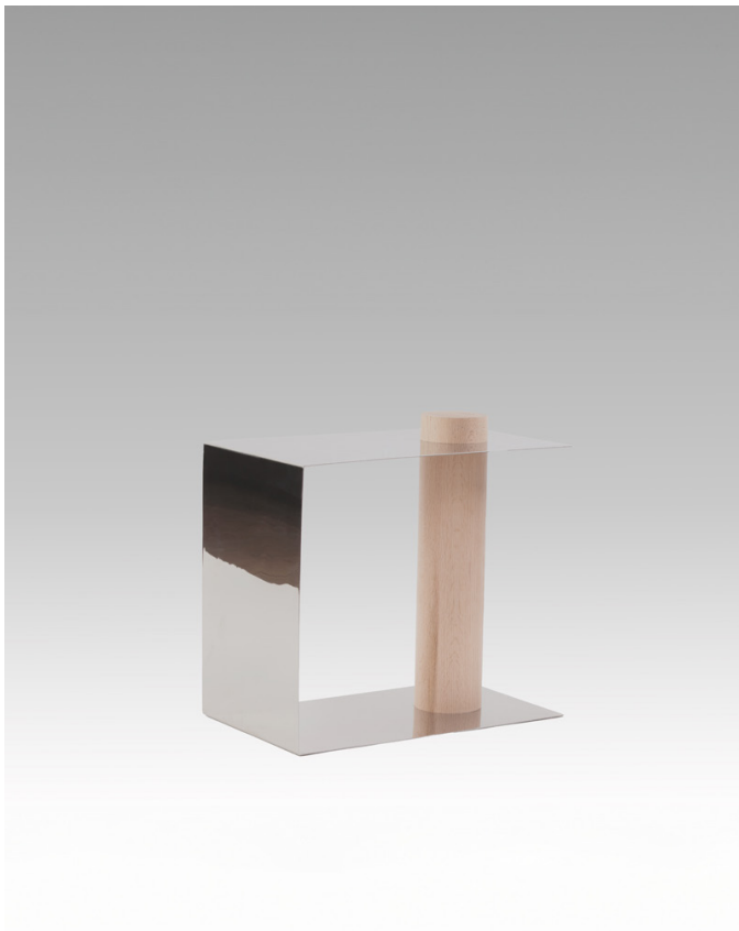
White Oak Polished Stainless Steel