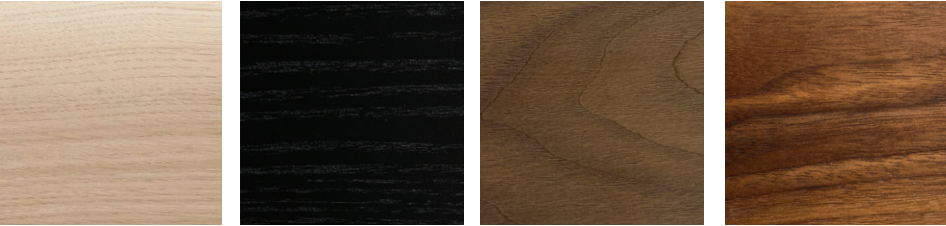
White Oak Black Stained Ash Walnut Oiled Walnut

Please note: All of our metal products have a clearcoat for further protection.