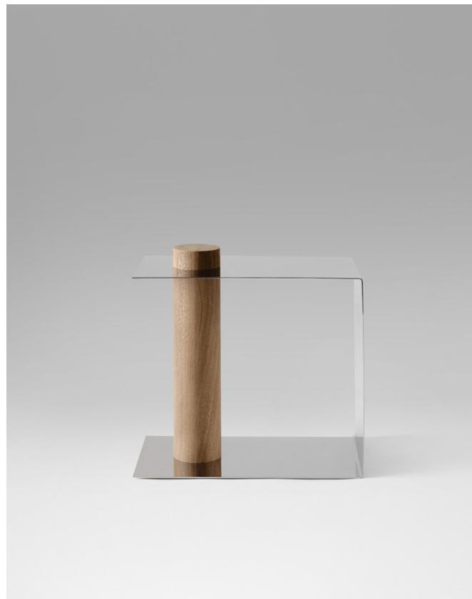
Walnut Polished Stainless Steel