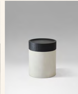
Totem Side Table