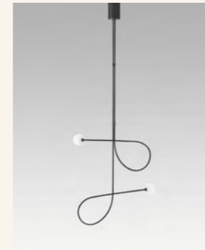
Bow Pendant light