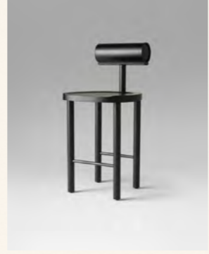
Una Counter Stool