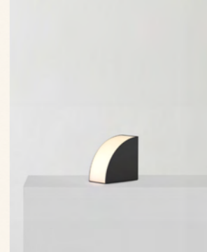
Phase Table Lamp