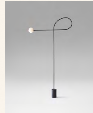
Bow Floor Lamp