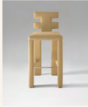
H Bar Stool